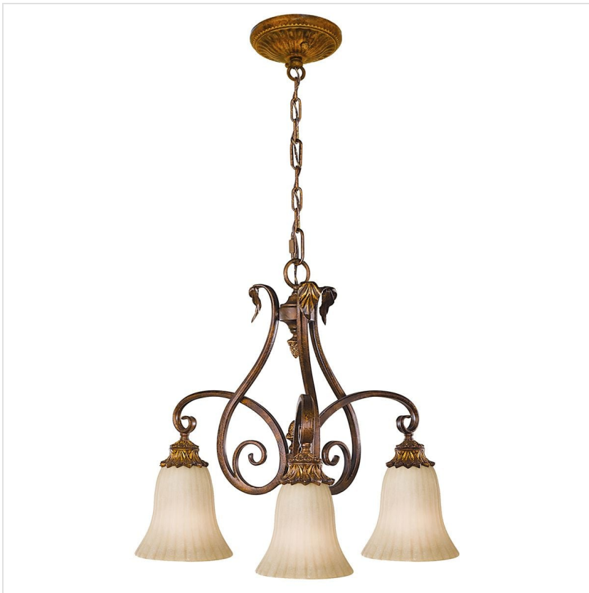
FE-SONOMAVALLEY3 Sonoma Valley 3 Light Chandelier - Aged Tortoise Shell