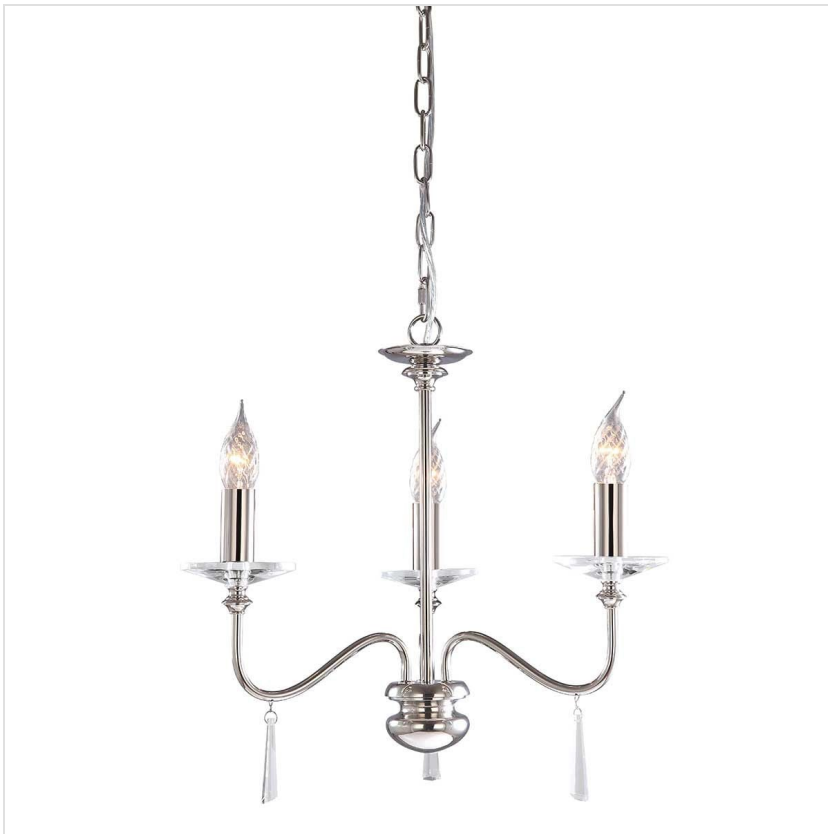
FP3-POL-NICKEL Finsbury Park 3 Light Chandelier - Polished Nickel