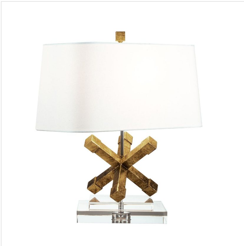
GN-JACKSON-SQUARE-TL Jackson Square 1 Light Table Lamp - Distressed Gold with Cream Shade