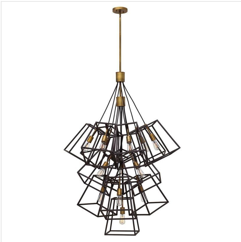
HK-FULTON-13P Fulton 13 Light Large Foyer Chandelier - Bronze and Brass