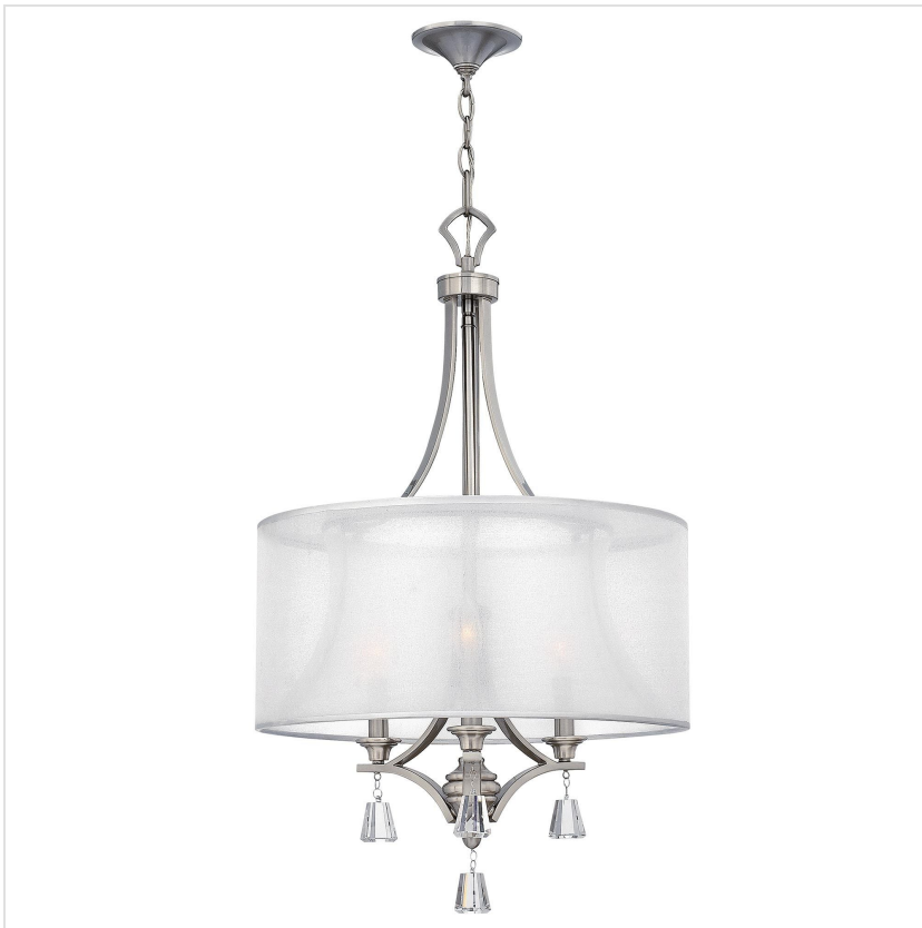
HK-MIME-3P Mime 3 Light Pendant Chandelier - Brushed Nickel