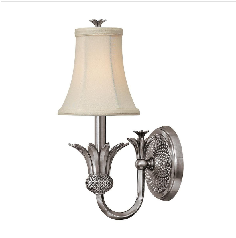
HK-PLANT1-PL Plantation 1 Light Wall Light - Polished Antique Nickel