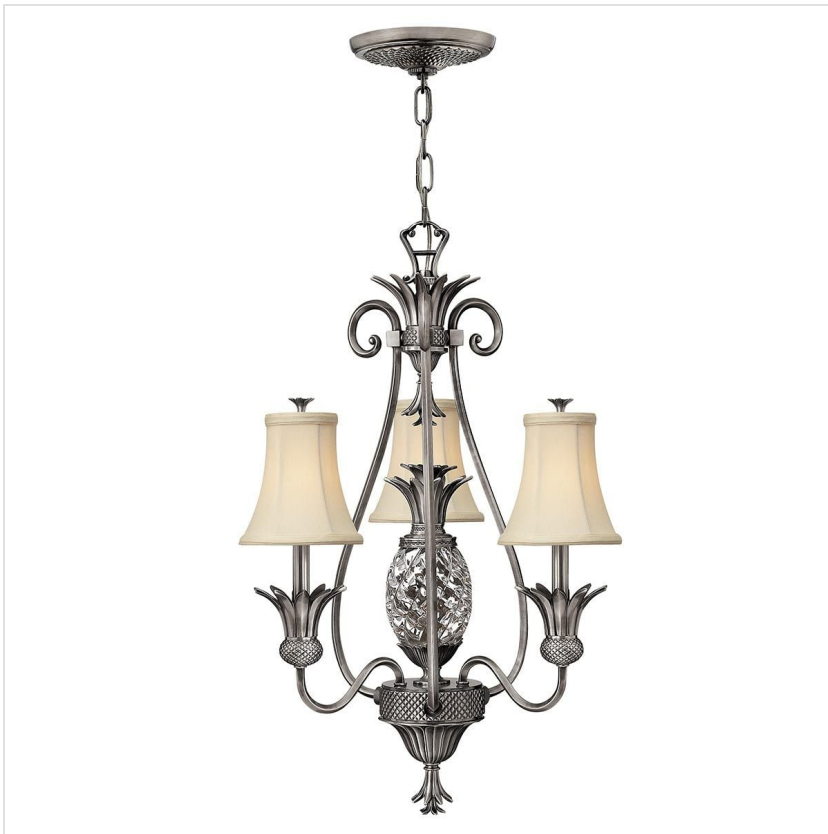
HK-PLANT3-PL Plantation 3 Light Chandelier - Polished Antique Nickel