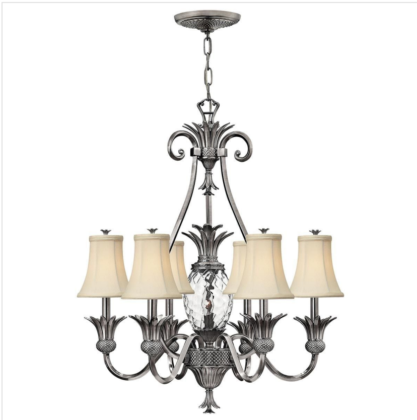
HK-PLANT7-PL Plantation 7 Light Chandelier - Polished Antique Nickel