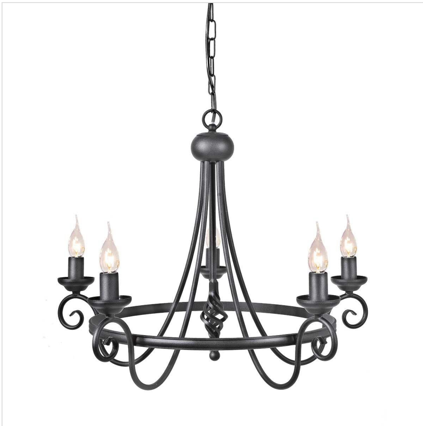
HR5-BLACK Harlech 5 Light Chandelier - Black