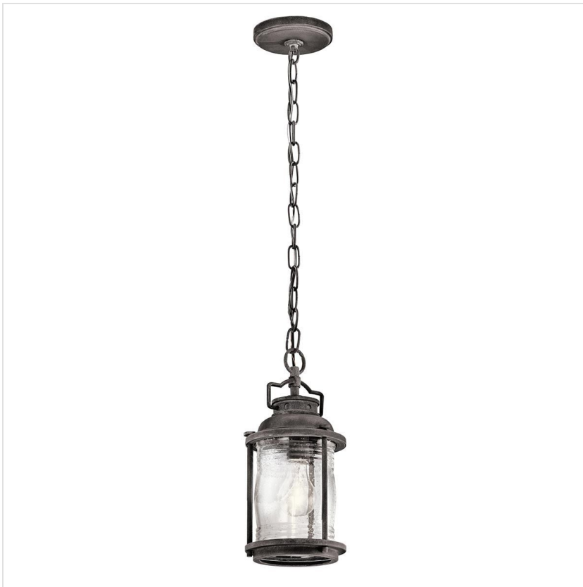
KL-ASHLANDBAY8-S Ashland Bay 1 Light Small Chain Lantern - Weathered Zinc