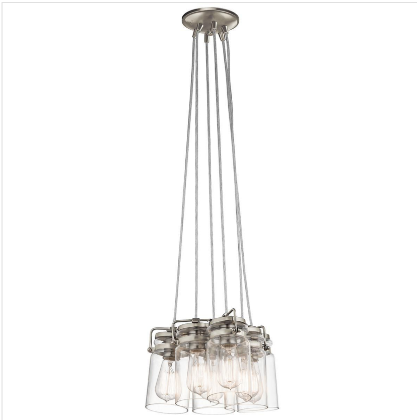
KL-BRINLEY6-NI Brinley 6 Light Pendant - Brushed Nickel