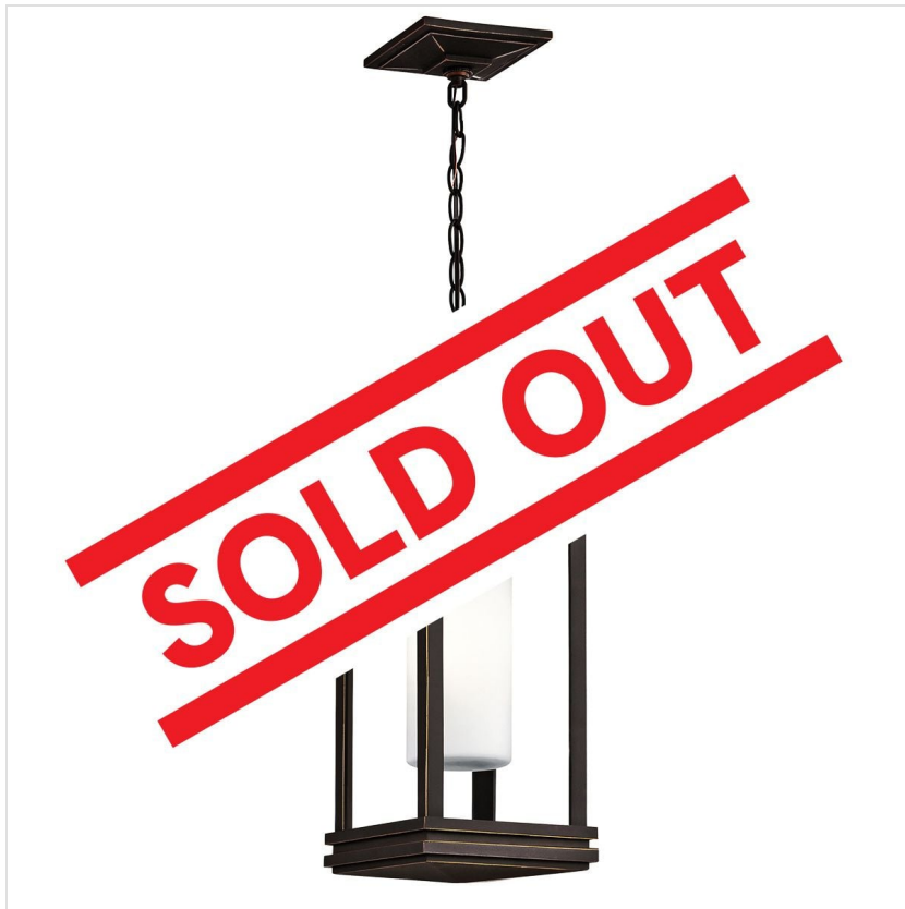
KL-SOUTH-HOPE8-S South Hope 1 Light Small Chain Lantern - Rubbed Bronze