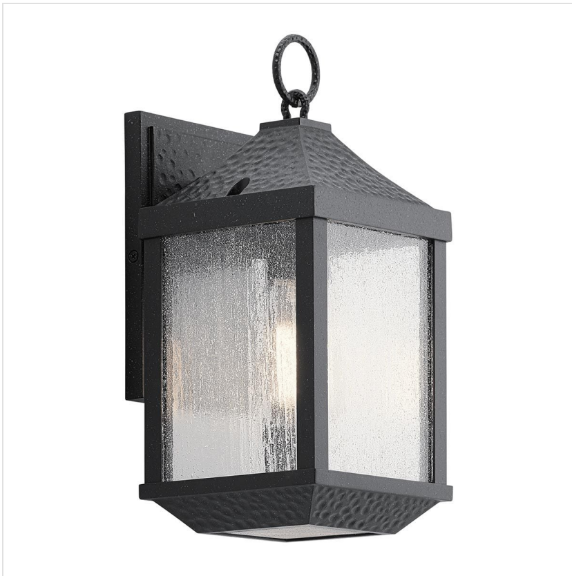
KL-SPRINGFIELD-S Springfield 1 Light Small Wall Lantern - Distressed Black