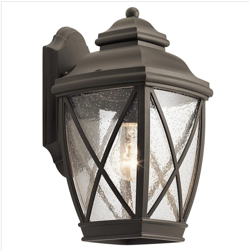
KL-TANGIER2-M Tangier 1 Light Medium Wall Lantern - Olde Bronze