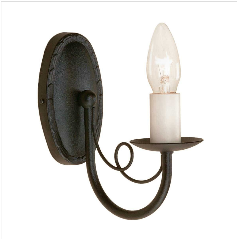
MN1-BLACK Minster 1 Light Wall Light - Black