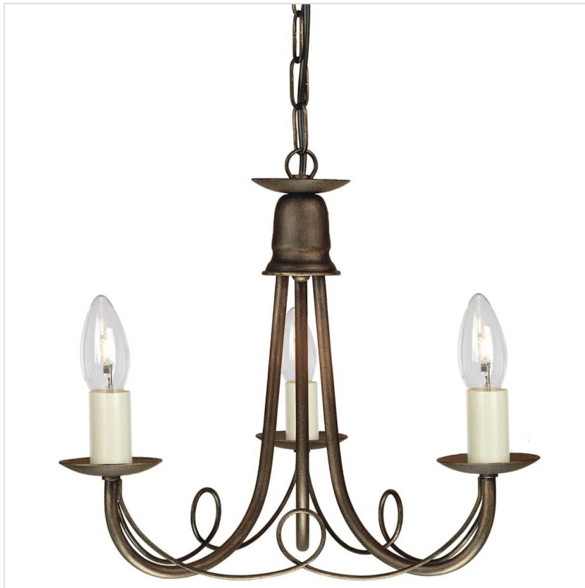
MN3-BLK-GOLD Minster 3 Light Chandelier - Black / Gold Patina