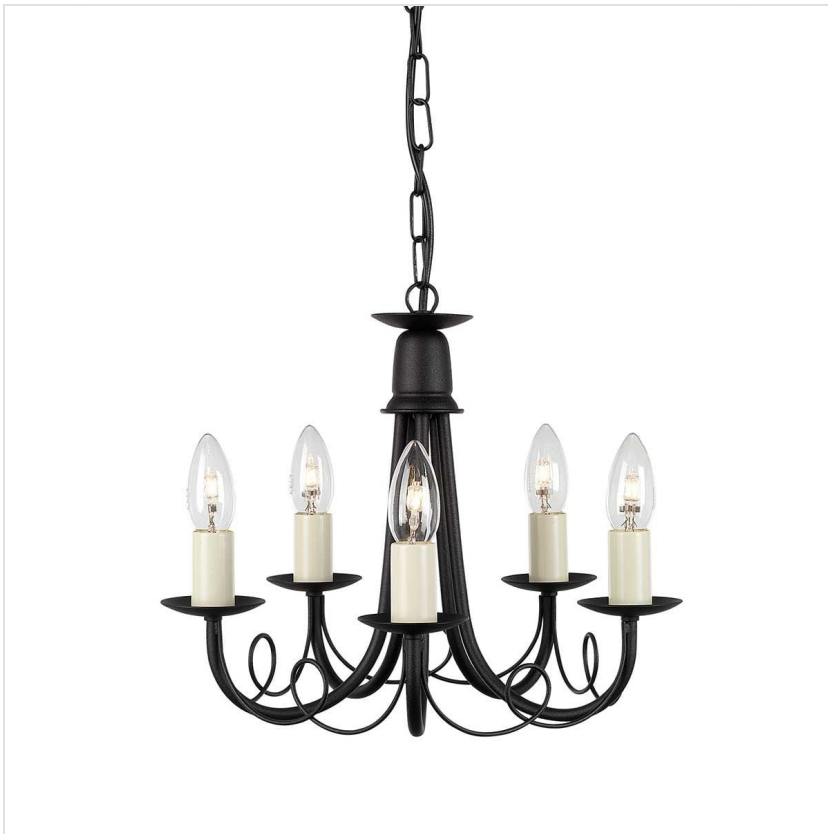
MN5-BLACK Minster 5 Light Chandelier - Black