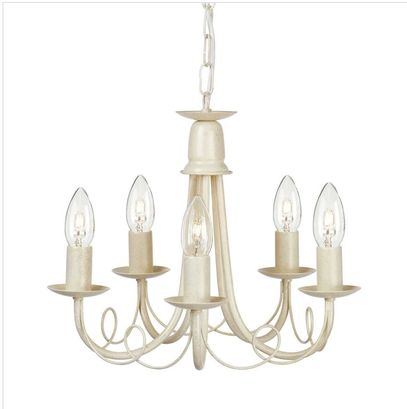
MN5-IV-GOLD Minster 5 Light Chandelier - Ivory / Gold Patina