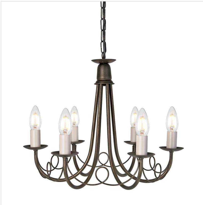
MN6-BLK-GOLD Minster 6 Light Chandelier - Black / Gold Patina