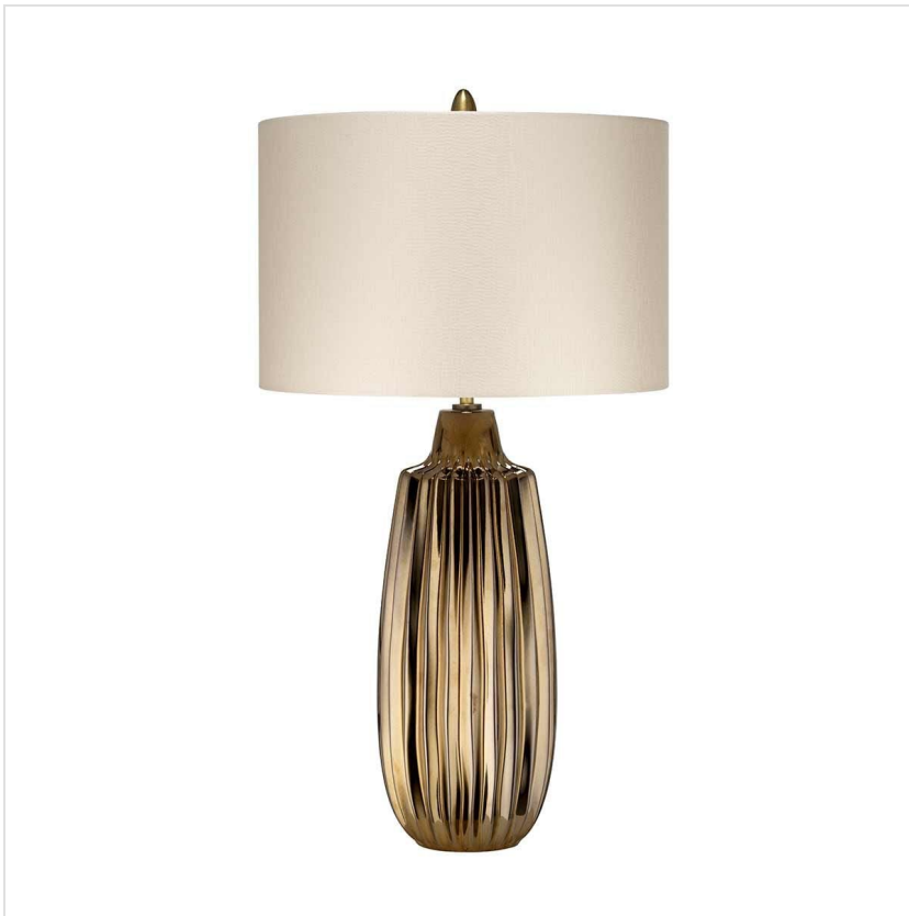
NEWHAM-TL-L Newham 1 Light Large Table Lamp - Bronze Ceramic / Pearl shade