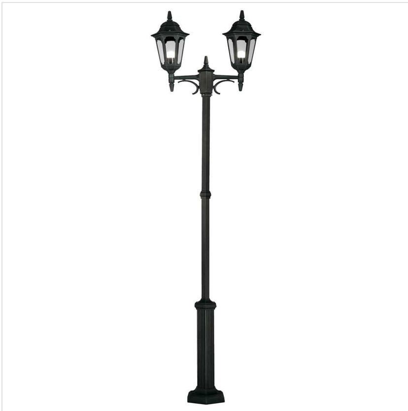
PR8-BLACK Parish 2 Light Twin Lamp Post - Black