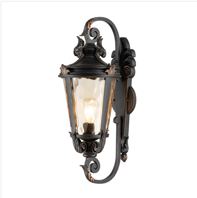
BT1-L Baltimore 1 Light Large Wall Lantern - Weathered Bronze