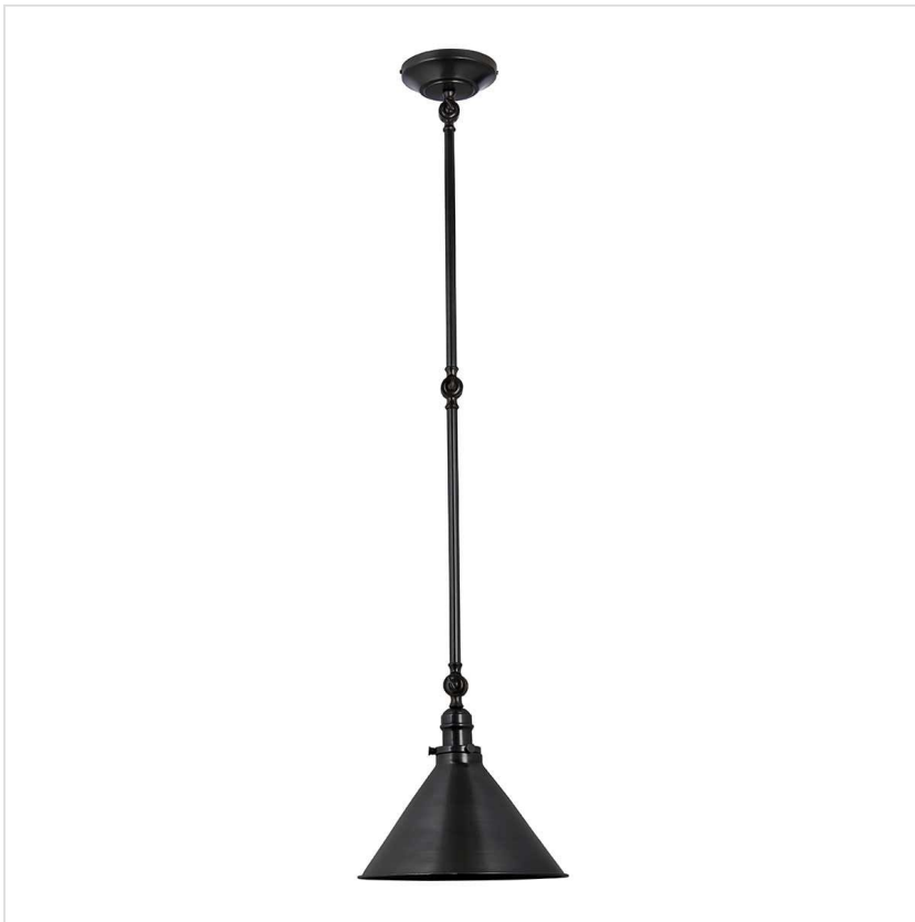
PV-GWP-OB Provence 1 Light Wall Light/Pendant - Old Bronze