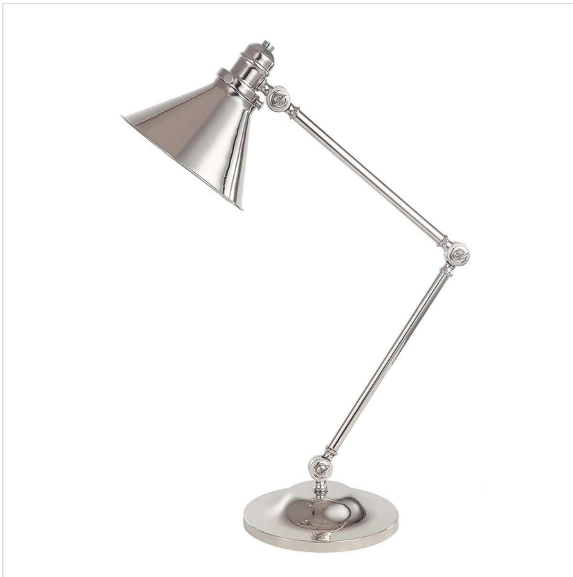
PV-TL-PN Provence 1 Light Table Lamp - Polished Nickel