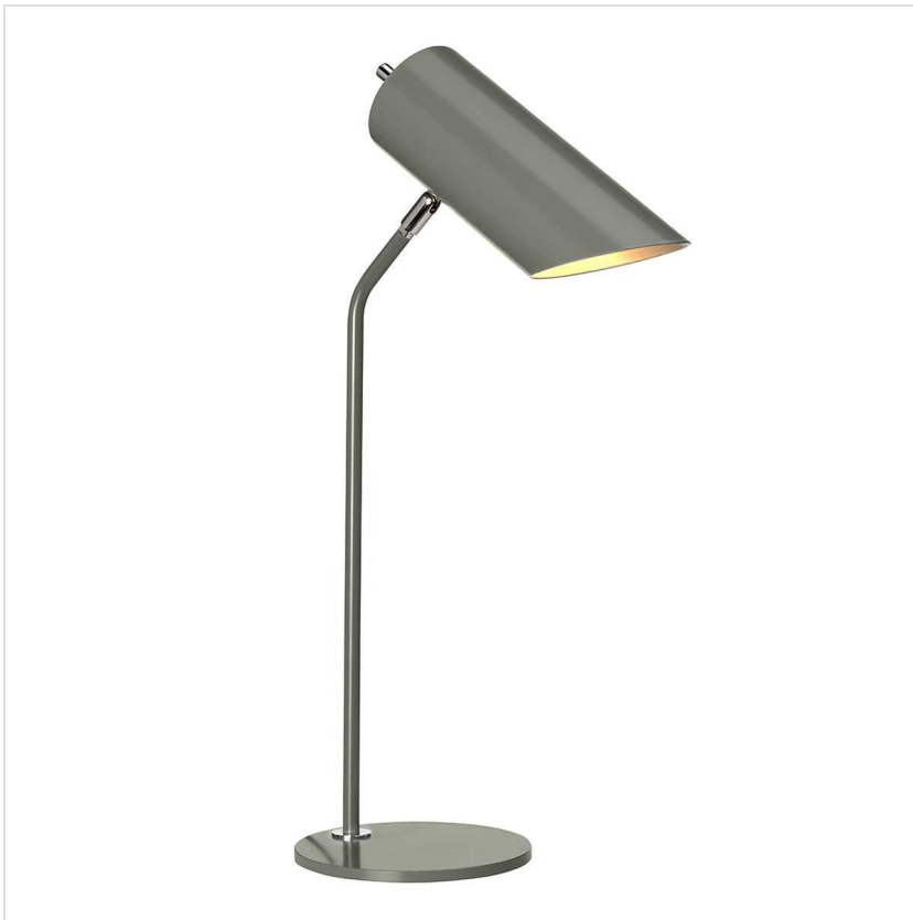
QUINTO-TL-GPN Quinto 1 Light Table Lamp - Dark Grey / Polished Nickel