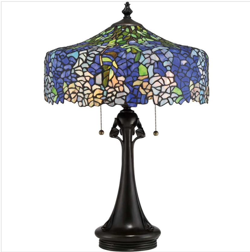
QZ-COBALT-TL Cobalt 3 Light Table Lamp - Vintage Bronze