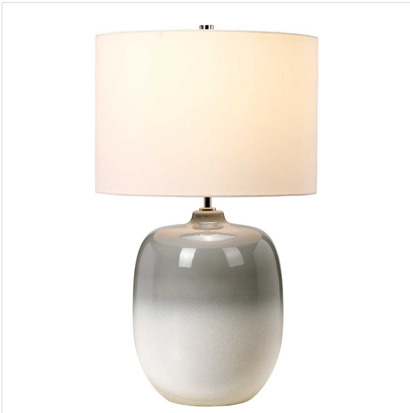
CHALKFARM-TL Chalk Farm Table Lamp - Light Grey / Chalk White with Ivory Shade