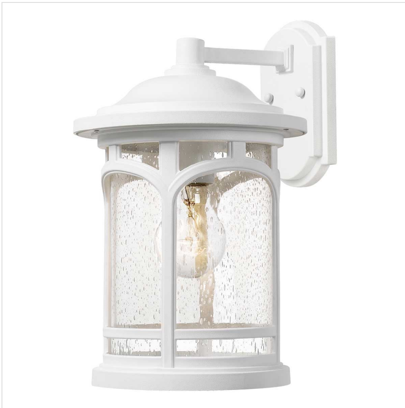
QZ-MARBLEHEAD-M-WHT Marblehead 1 Light Medium Wall Lantern - White