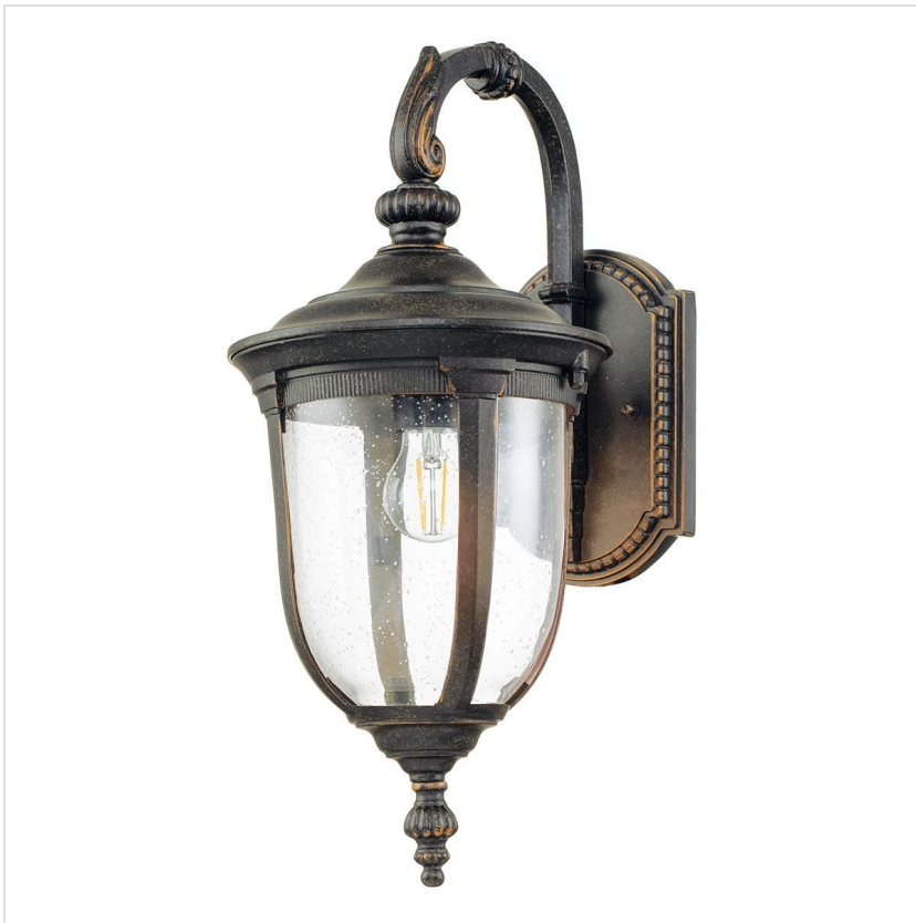
CL2-M Cleveland 1 Light Medium Wall Lantern - Weathered Bronze