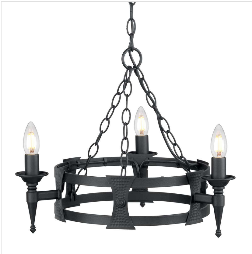
SAX3-BLK Saxon 3 Light Chandelier - Black