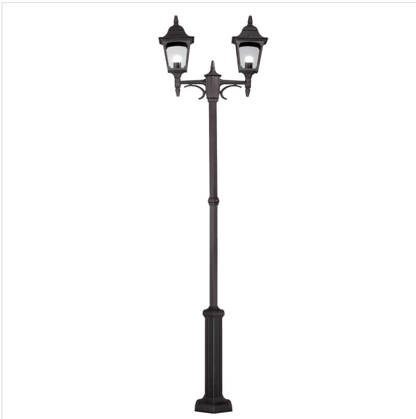
CP8-BLACK Chapel 2 Light Twin Post - Black