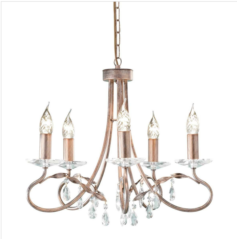
CRT5-SILVER-GOLD Christina 5 Light Chandelier - Silver / Gold Patina