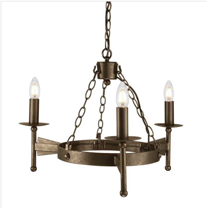
CW3-OLD-BRZ Cromwell 3 Light Chandelier - Old Bronze