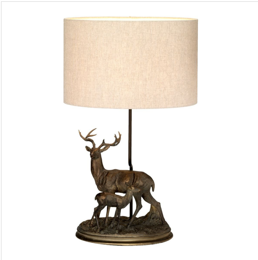
DL-AMELIA-TL Amelia 1 Light Table Lamp with Oval Shade - Bronze Patina with Natural Shade