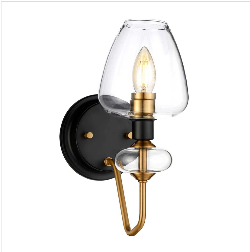
DL-ARMAND1-AB Armand 1 Light Wall Light - Aged Brass Plated & Charcoal Black Paint