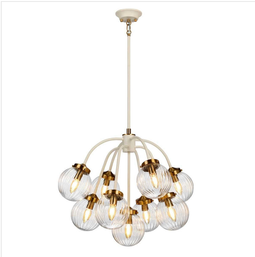
DL-COSMOS9 Cosmos 9 Light Pendant - Cream Painted and Aged Brass