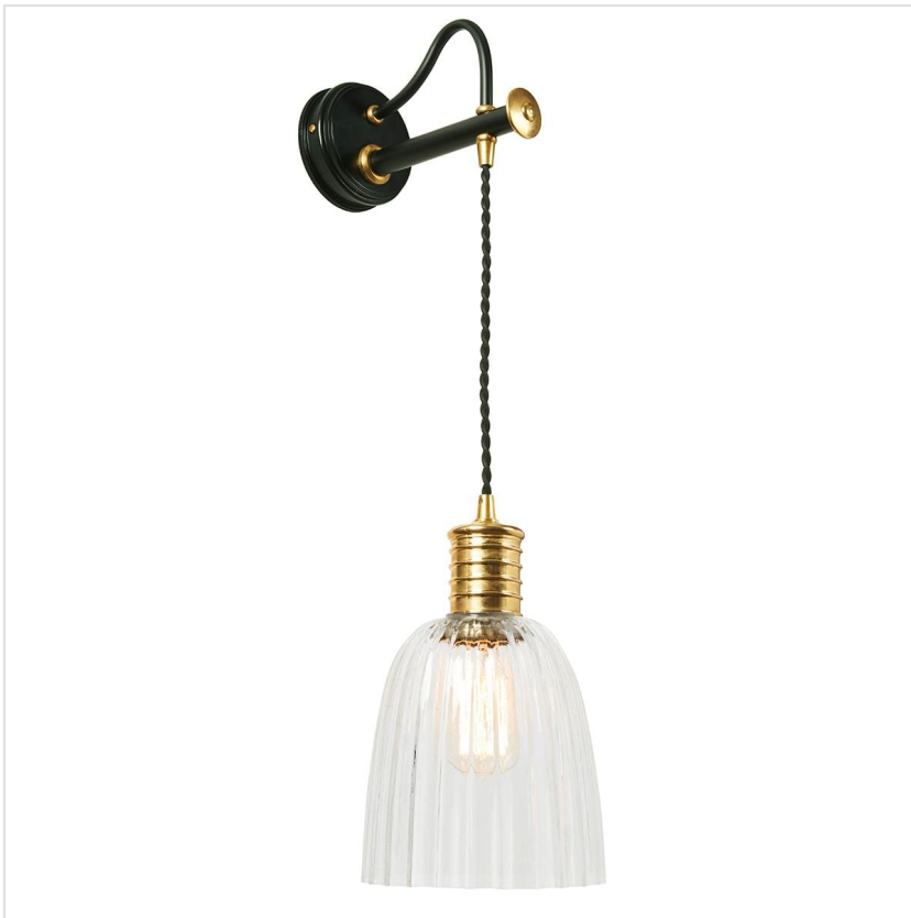
DOUILLE1-BPB Douille 1 Light Wall Light - Black / Polished Brass