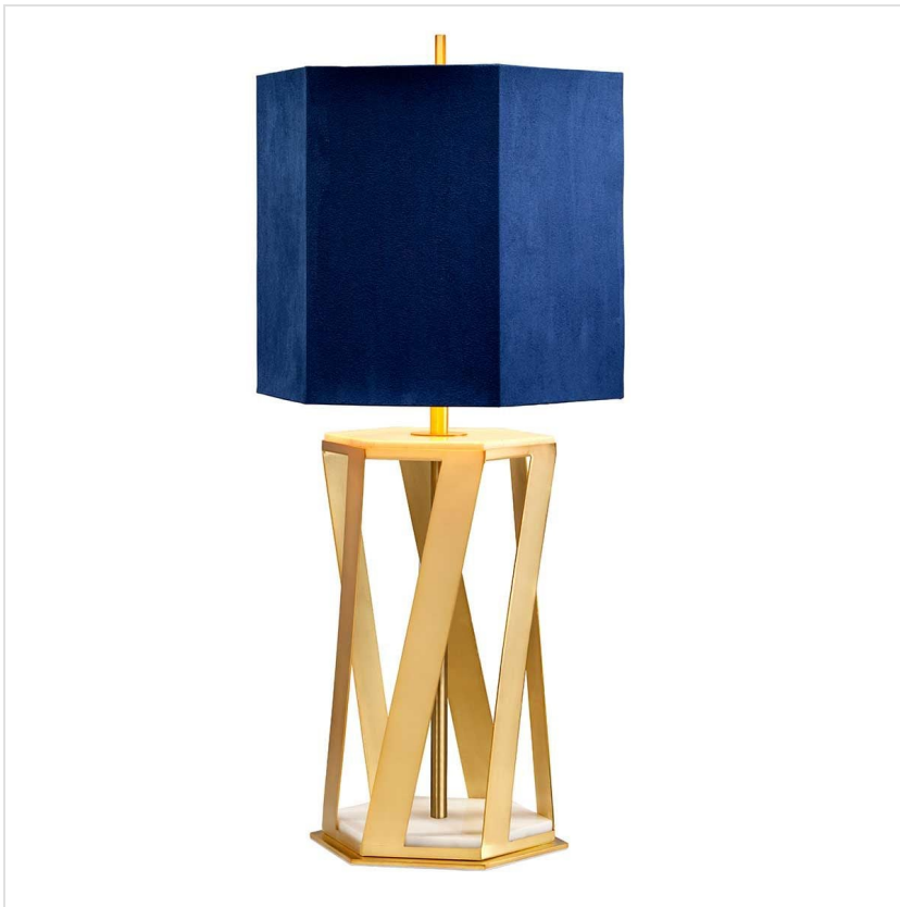
APOLLO-TL Apollo 1 Light Table Lamp with Blue Shade - Brushed Brass