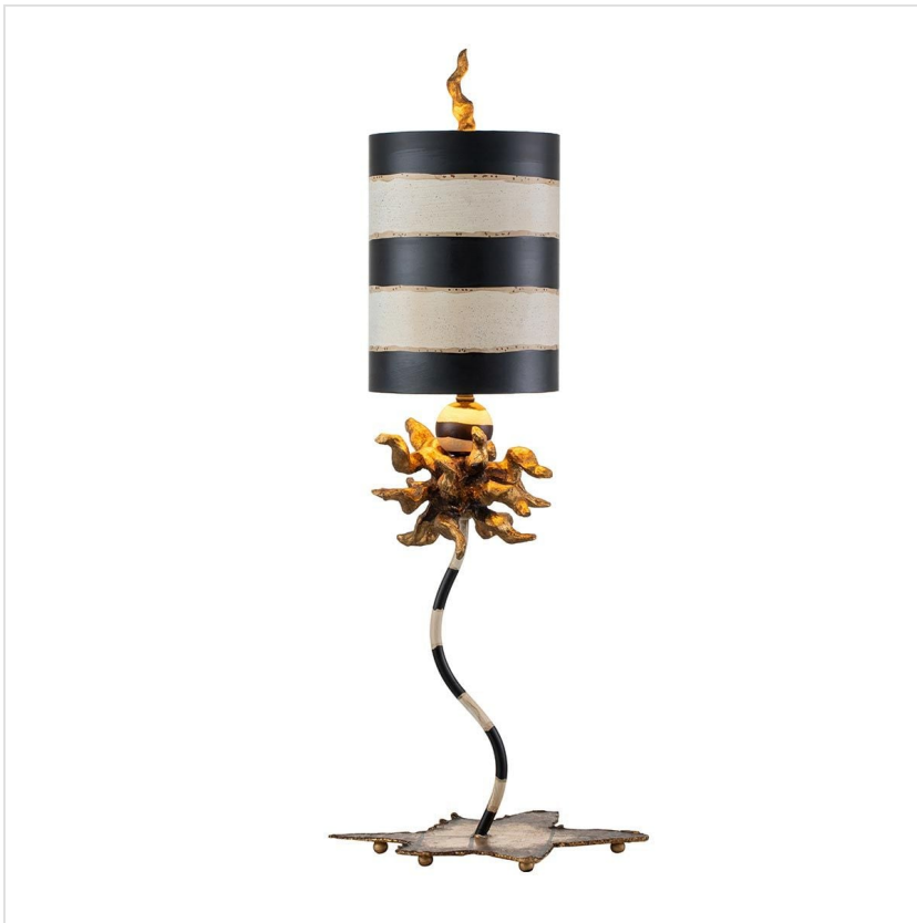
FB-DOMINIQUE-TL Dominique 1 Light Table Lamp - Gold Leaf, Black with Black and Cream Striped Shade