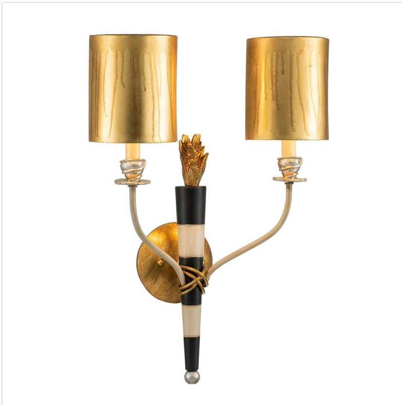
FB-FLAMBEAU2 Flambeau 2 Light Wall Light - Gold and Black with Parchment Shades