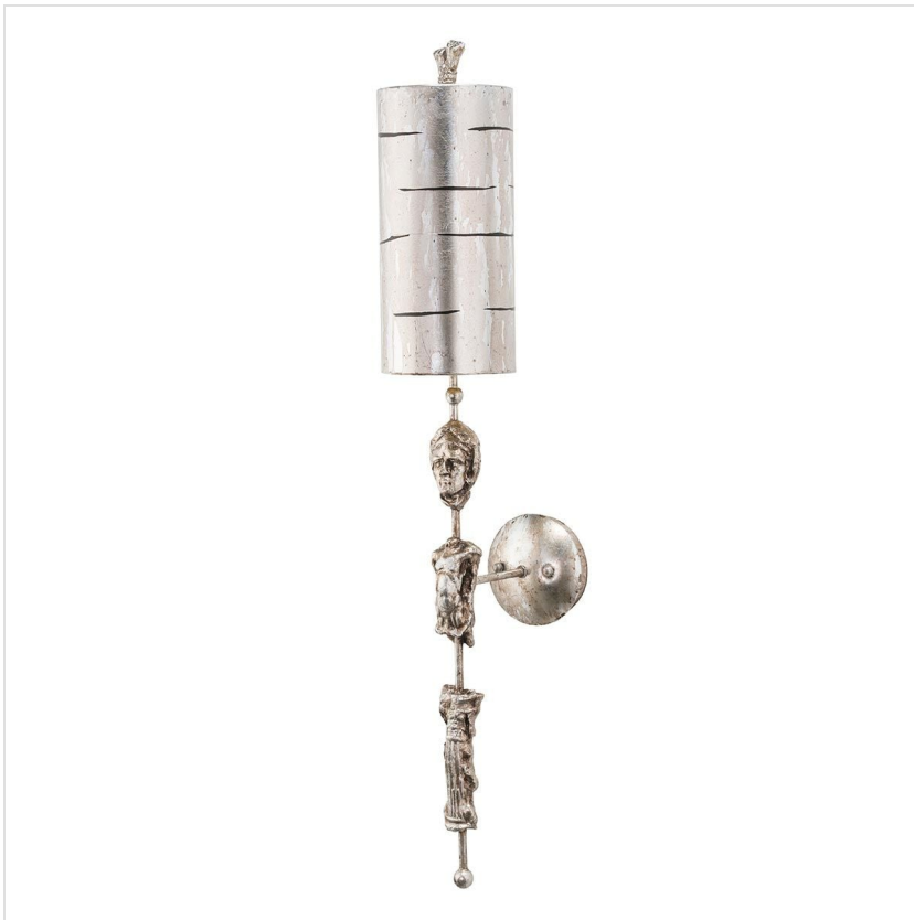
FB-FRAGMENT-S1 Fragment 1 Light Wall Light - Silver leaf