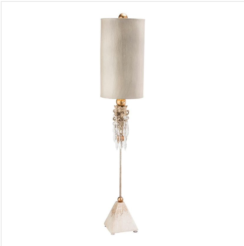
FB-MADISON-TL Madison 1 Light Table Lamp - Putty Patina, Gold Leaf with Putty Patina Shade