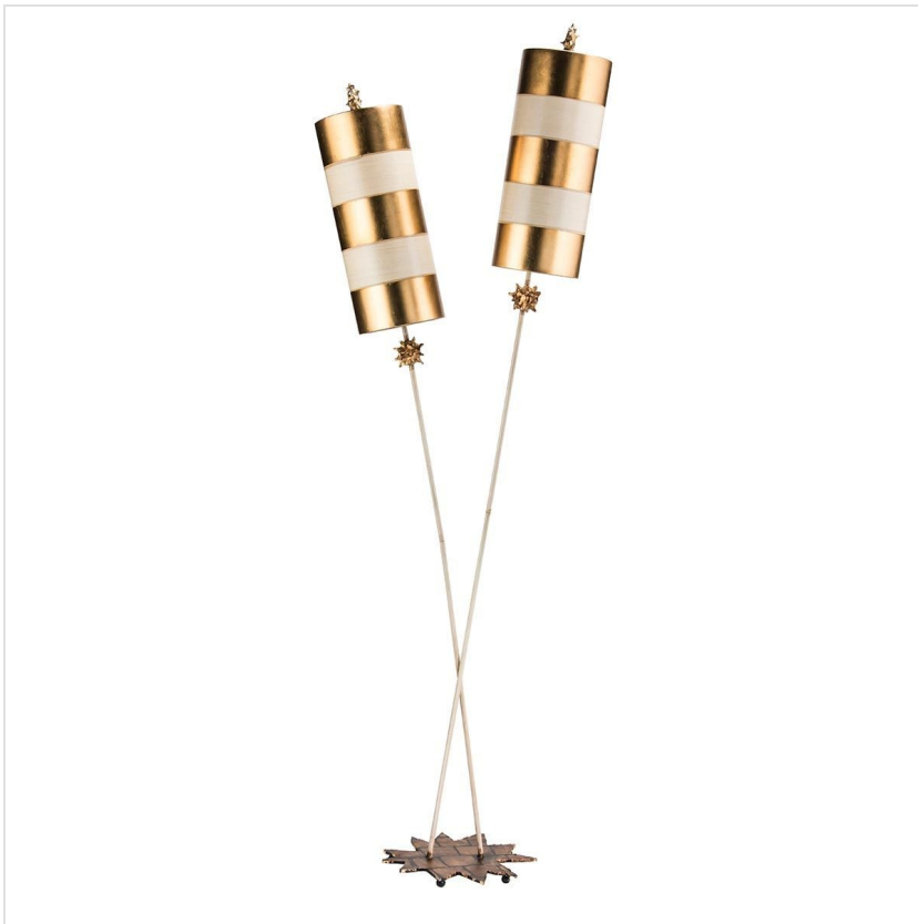
FB-NETTLELUX-G-FL Nettle Luxe 2 Light Floor Lamp - Gold and Taupe