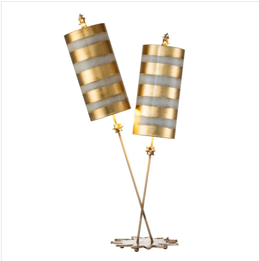
FB-NETTLELUX-G-TL Nettle Luxe 2 Light Table Lamp - Gold Leaf and Taupe