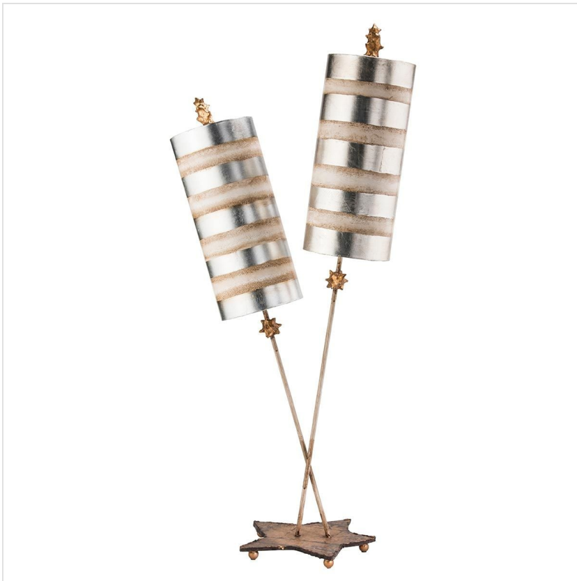
FB-NETTLELUX-S-TL Nettle Luxe 2 Light Table Lamp - Silver Leaf and cream