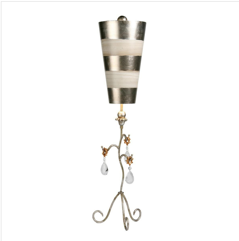
FB-TIVOLI-TL-SV Tivoli 1 Light Table Lamp - Silver & Cream Patina