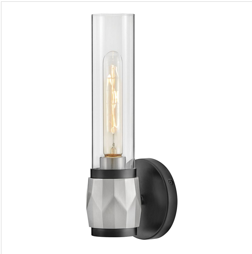
HK-ELLISON1-BK-BN Ellison 1 It Wall Light. - Black with Brushed Nickel