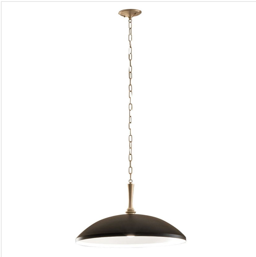
KL-DELAROSA-P-BK Delarosa 1 Lt Ceiling Pendant - Black & Champagne Bronze