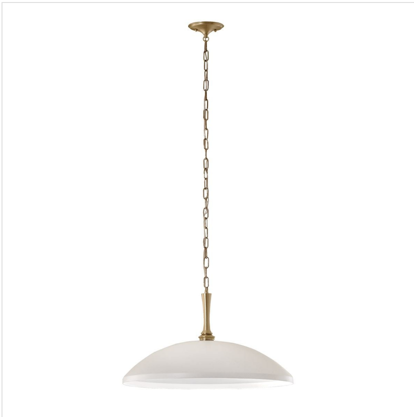
KL-DELAROSA-P-WH Delarosa 1 Lt Ceiling Pendant - White & Champagne Bronze