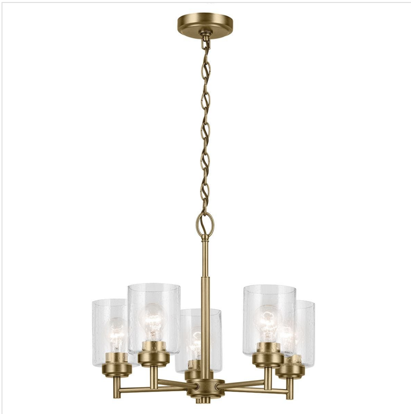
KL-WINSLOW5-NBR Winslow 5 Lt Chandelier - Natural Brass